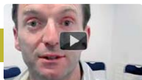
Clinical Service Manager

“This training has definitely improved my communication skills with clients - thanks.” Health Visitor