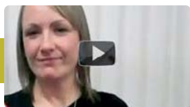
Youth Service Practitioner & Trainer

"I'll recommend this course to all of my colleagues." Counsellor